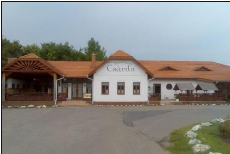
Before Rose inn